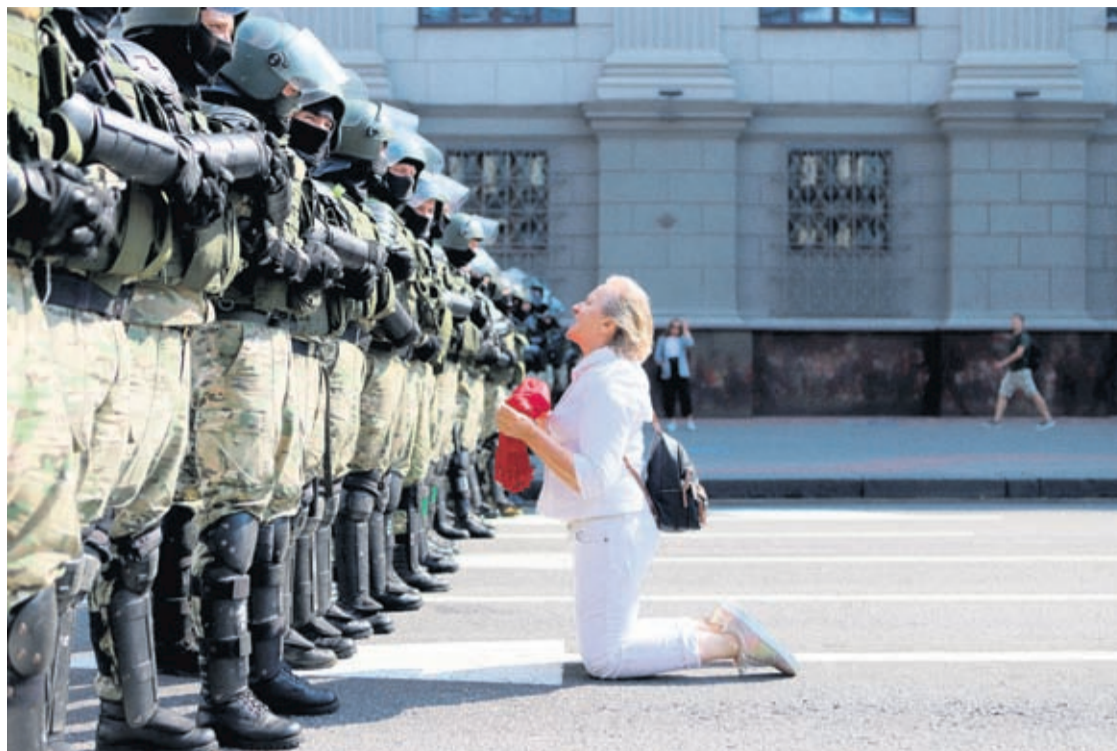
A woman kneels in front of a riot police line as they block Belarusian opposition supporters rally in the center of Minsk, Belarus, Sunday, Aug. 30, 2020.

The marchers, chanting "Freedom!" and "Resign!" eventually reached the outskirts of the presidential palace, which was blocked off by shield-bearing riot police. There were